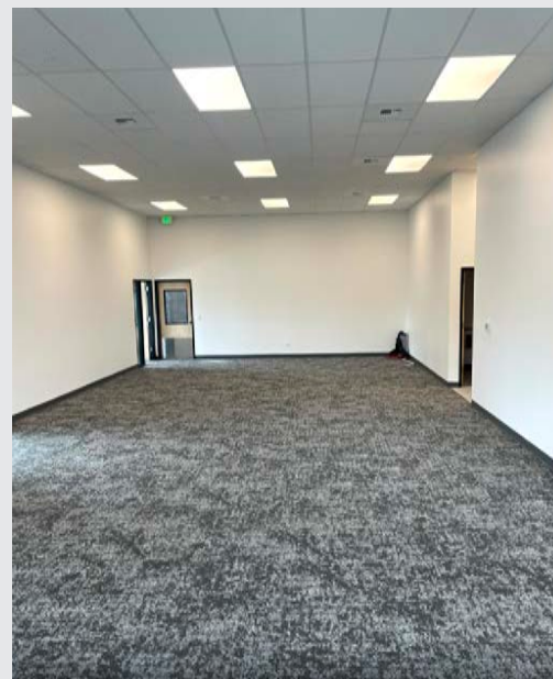
Spacious office layout