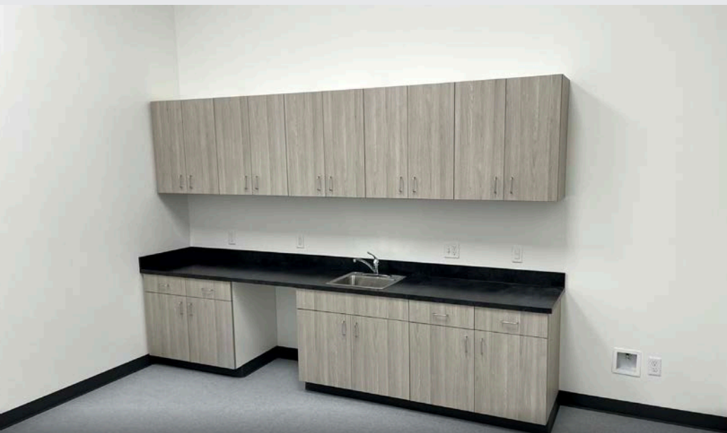
Contemporary kitchenette aesthetics