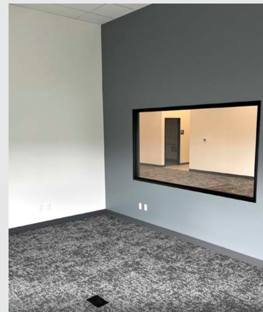
Sizable private spaces