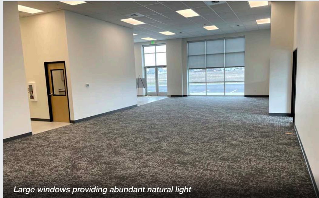
Large windows providing abundant natural light