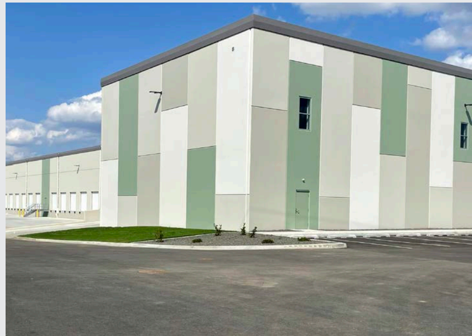
Building B Office T1